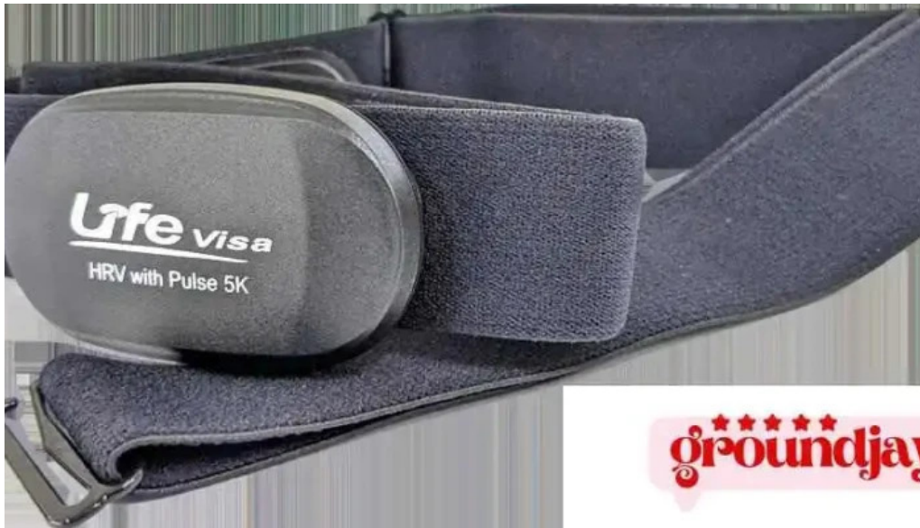
Tai Wan Sheng Li Ke Ji Gu Fen You Xian Gong Si taiwan biotronic technology inc Shang Jia Shang Chuan