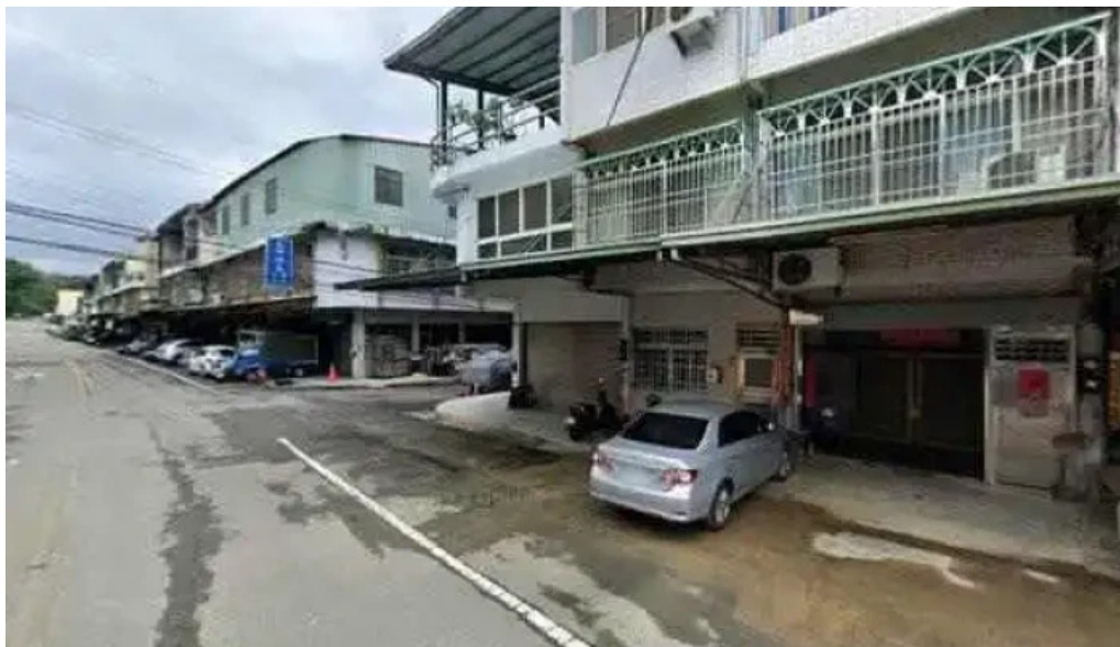
Tai Wan Sheng Li Ke Ji Gu Fen You Xian Gong Si taiwan biotronic technology inc Quan Bu