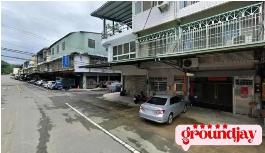
?????????????taiwan biotronic technology inc taichung city wufeng district