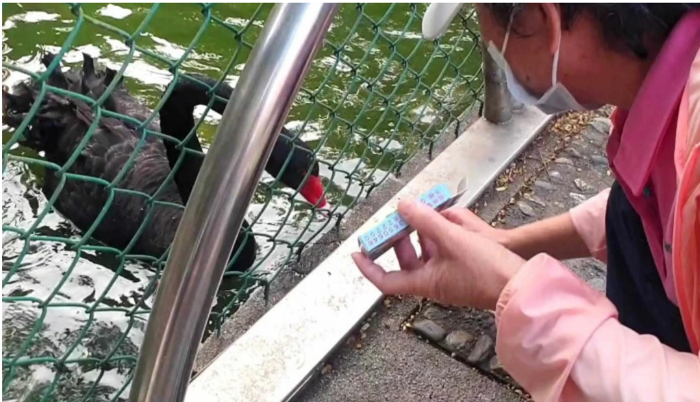
Guo Li Jia Yi Da Xue ??