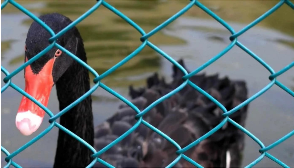
Guo Li Jia Yi Da Xue ??