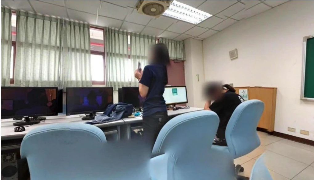
Guo Li Jia Yi Da Xue Jie Jing He 360 Du Quan Jing Zhao