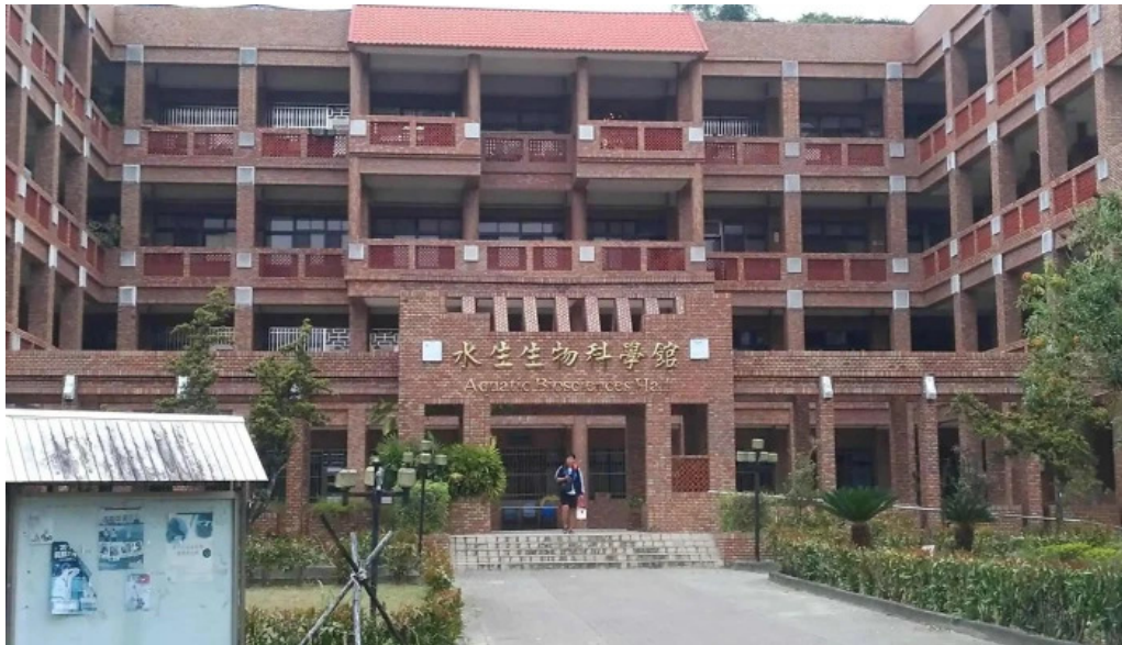
Guo Li Jia Yi Da Xue ????