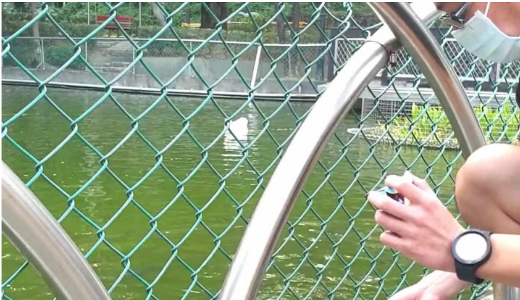
Guo Li Jia Yi Da Xue ??