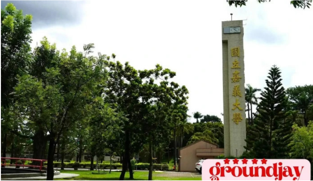
?????? chiayi city east district