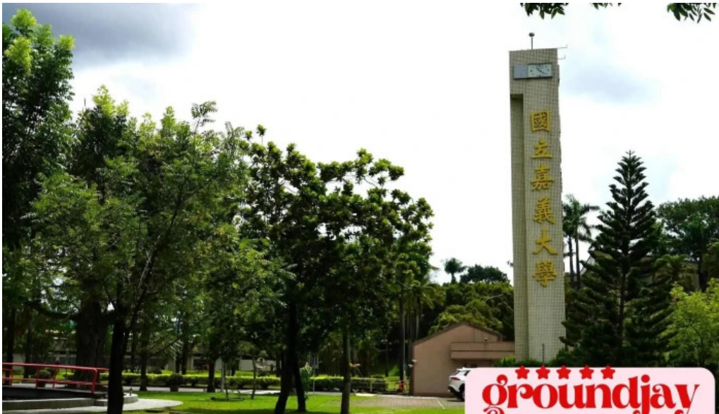
Guo Li Jia Yi Da Xue Quan Bu