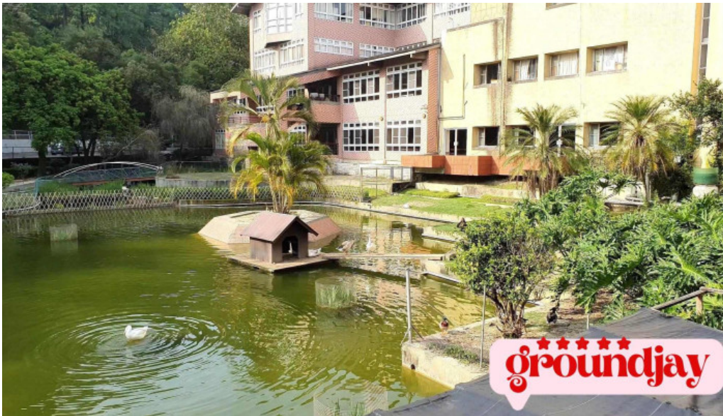
Guo Li Jia Yi Da Xue Shi Pin