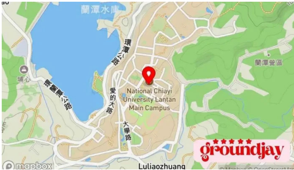
Guo Li Jia Yi Da Xue ??