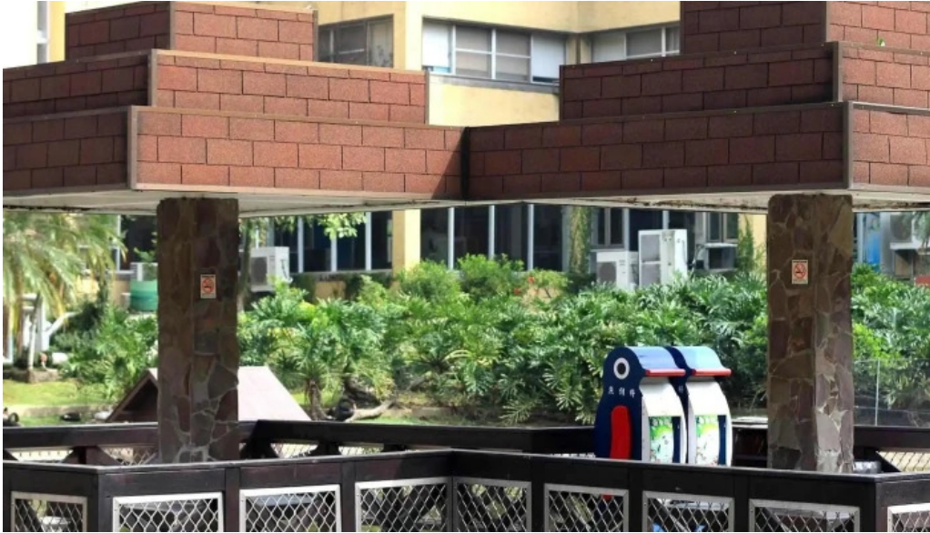
Guo Li Jia Yi Da Xue ??