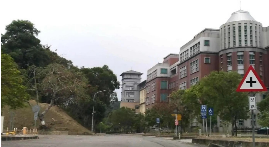
Guo Li Jia Yi Da Xue chiayi city east district