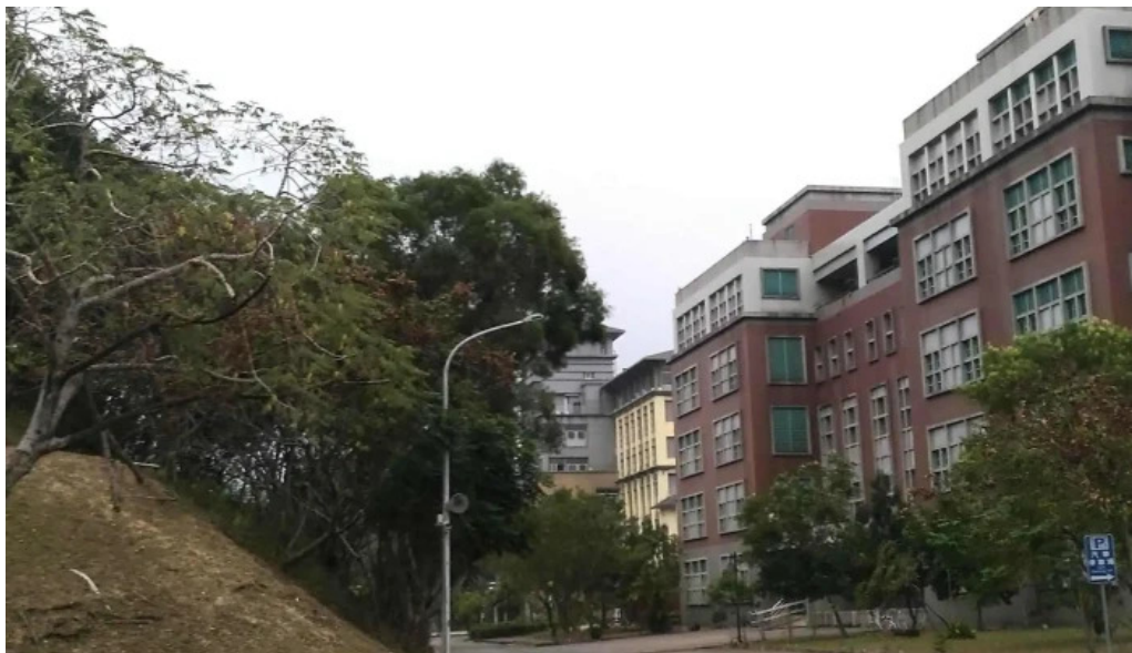
Guo Li Jia Yi Da Xue ??