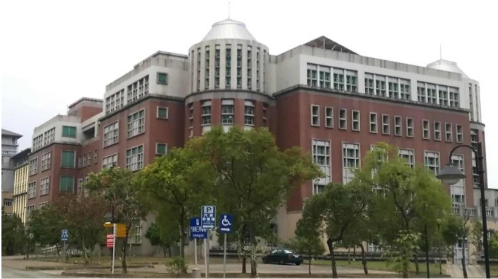
Guo Li Jia Yi Da Xue ??