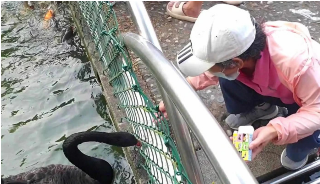
Guo Li Jia Yi Da Xue ??