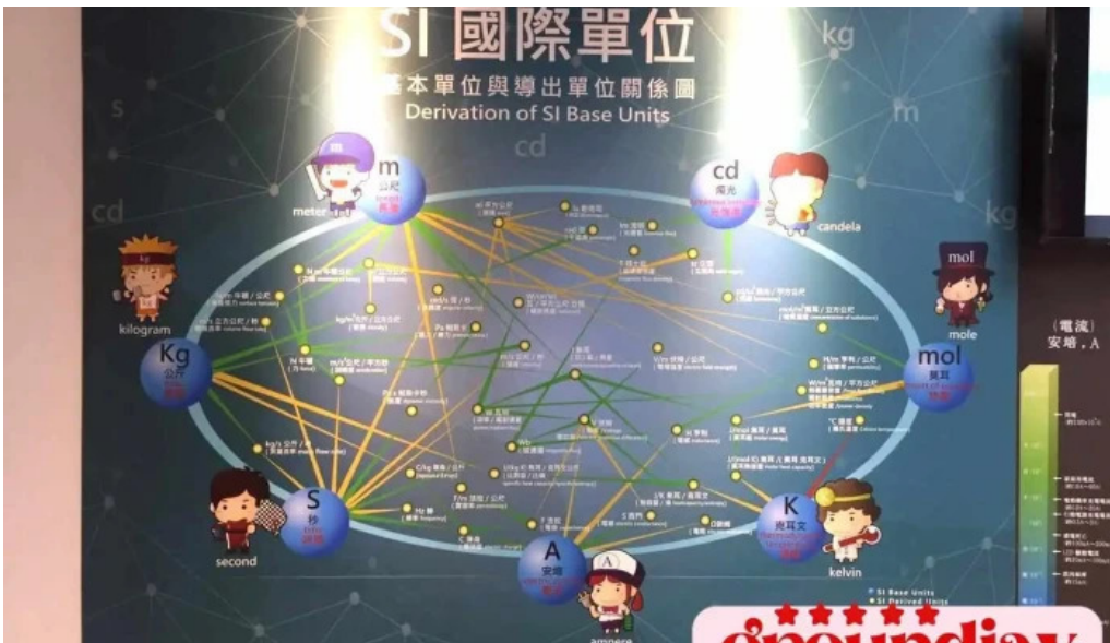
Ji Liang Yu Lu Neng Tan Suo Guan Quan Bu