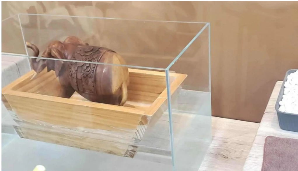
Ji Liang Yu Lu Neng Tan Suo Guan ??