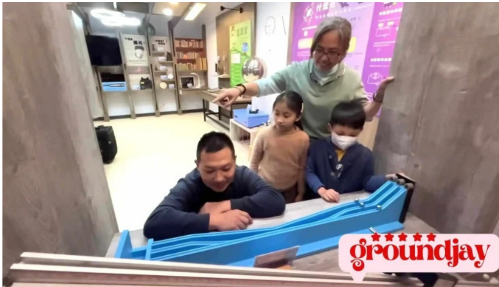
Ji Liang Yu Lu Neng Tan Suo Guan Shi Pin