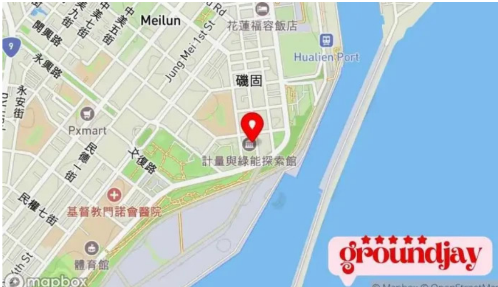
Ji Liang Yu Lu Neng Tan Suo Guan ??