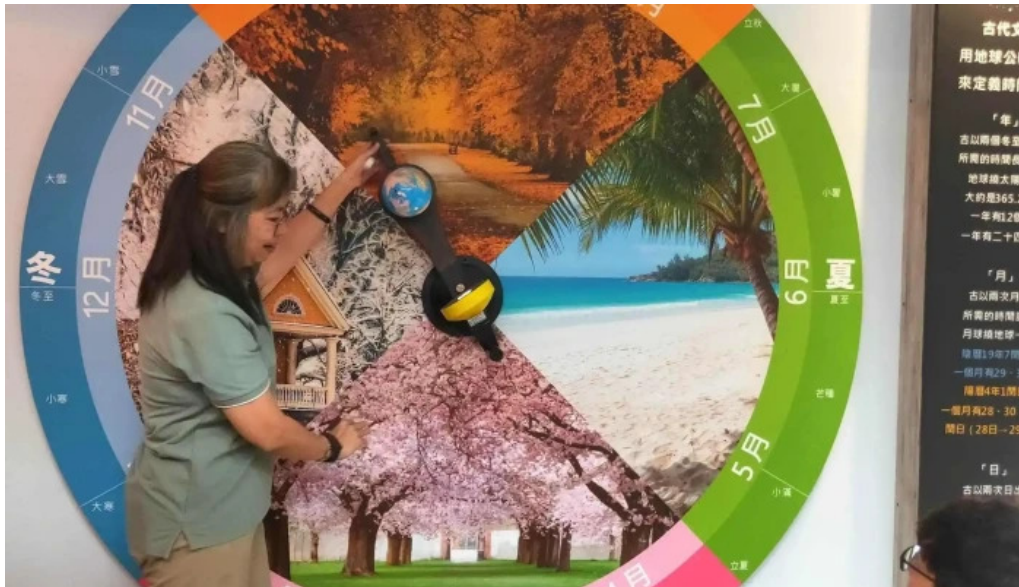
Ji Liang Yu Lu Neng Tan Suo Guan ??