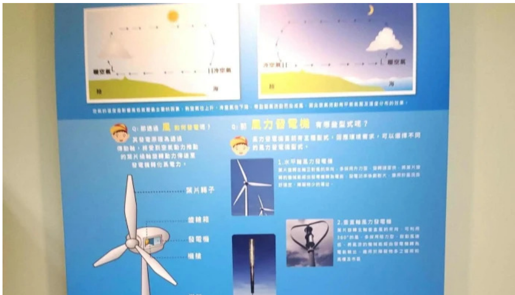
Ji Liang Yu Lu Neng Tan Suo Guan ??