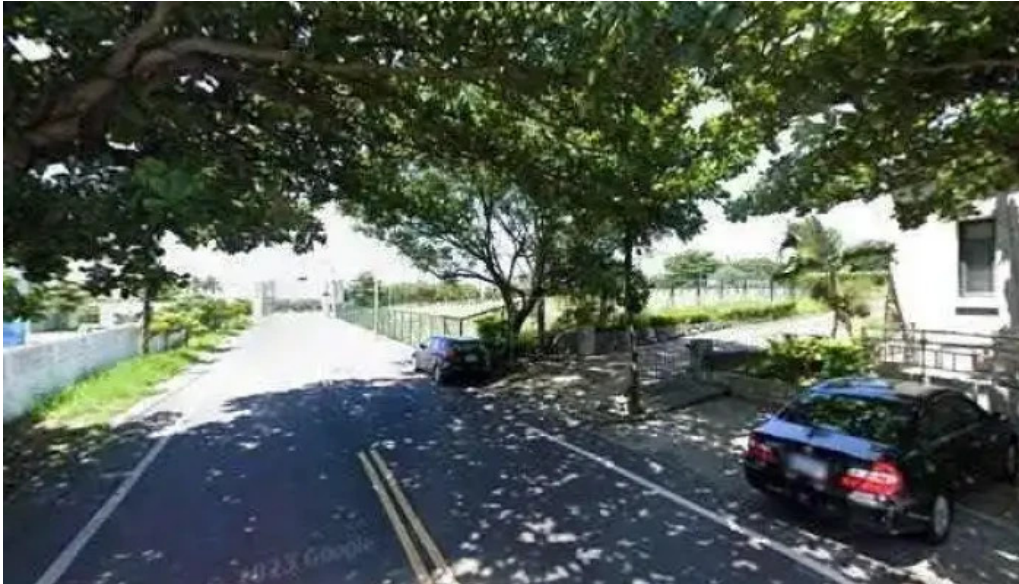
Ji Liang Yu Lu Neng Tan Suo Guan Jie Jing He 360 Du Quan Jing Zhao