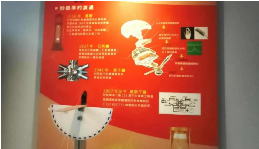
Ji Liang Yu Lu Neng Tan Suo Guan Zui Xin