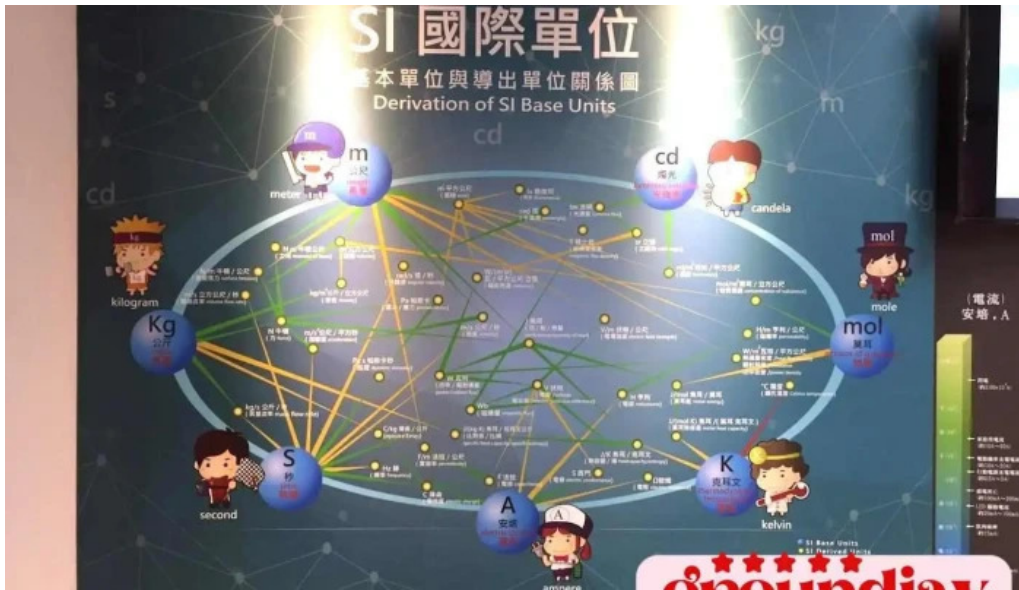
????????? hualien county hualien city