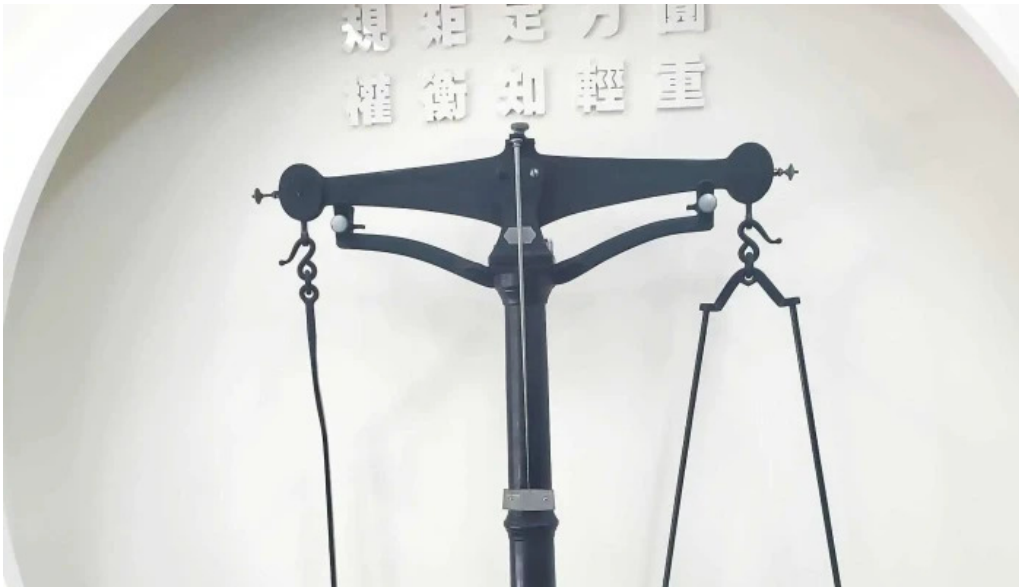
Ji Liang Yu Lu Neng Tan Suo Guan ??