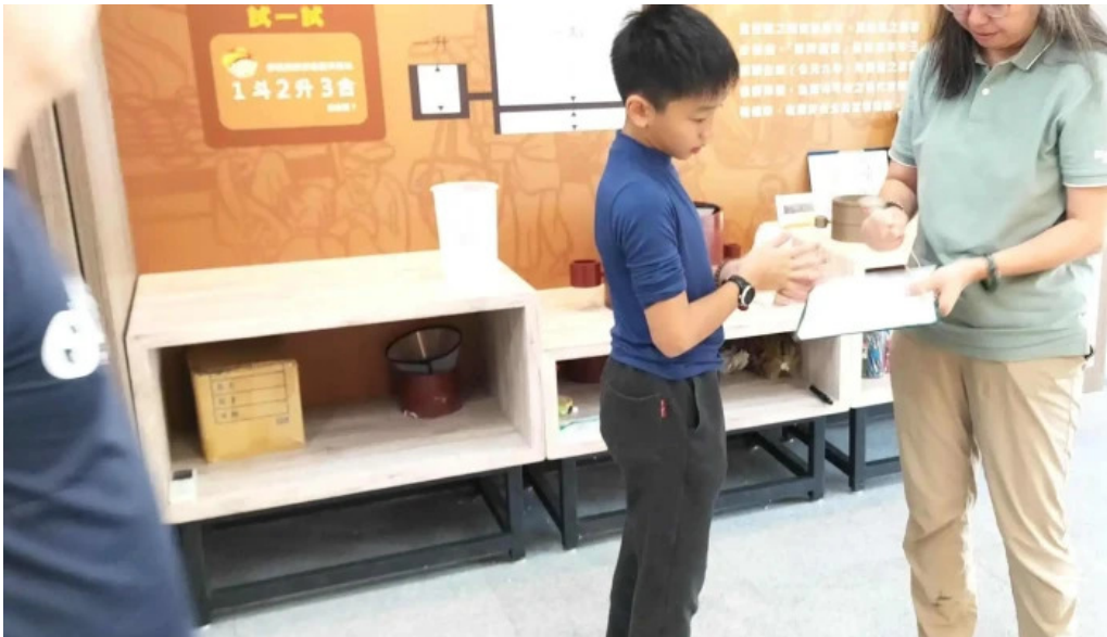
Ji Liang Yu Lu Neng Tan Suo Guan hualien county hualien city