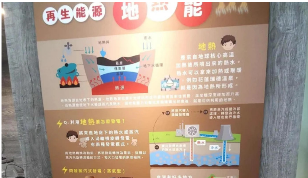
Ji Liang Yu Lu Neng Tan Suo Guan ??