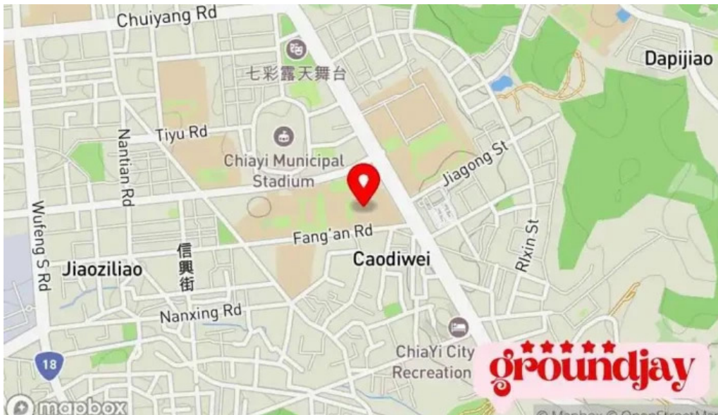
Da Tong Ji Zhu Xue Yuan ??