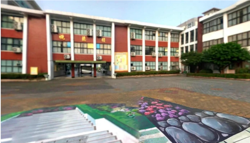
Da Tong Ji Zhu Xue Yuan Jie Jing He 360 Du Quan Jing Zhao