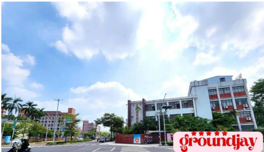
Da Tong Ji Zhu Xue Yuan Quan Bu