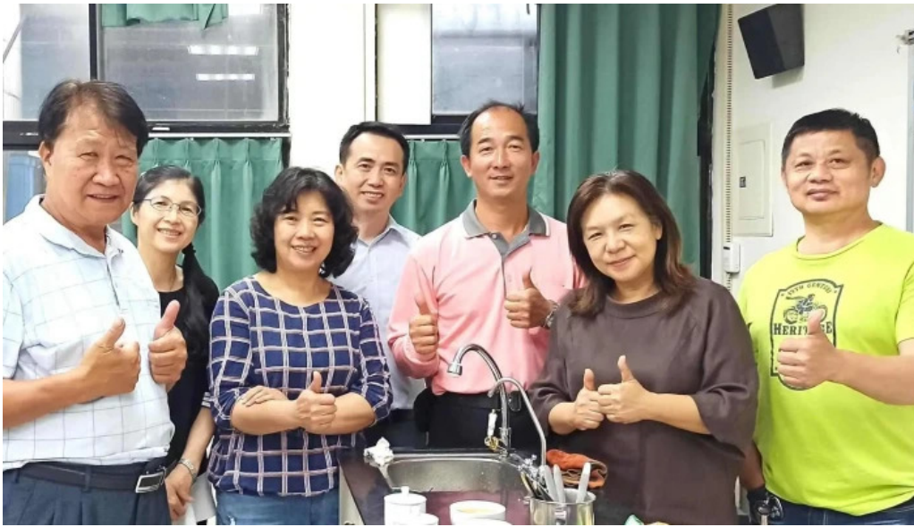
Da Tong Ji Zhu Xue Yuan ??