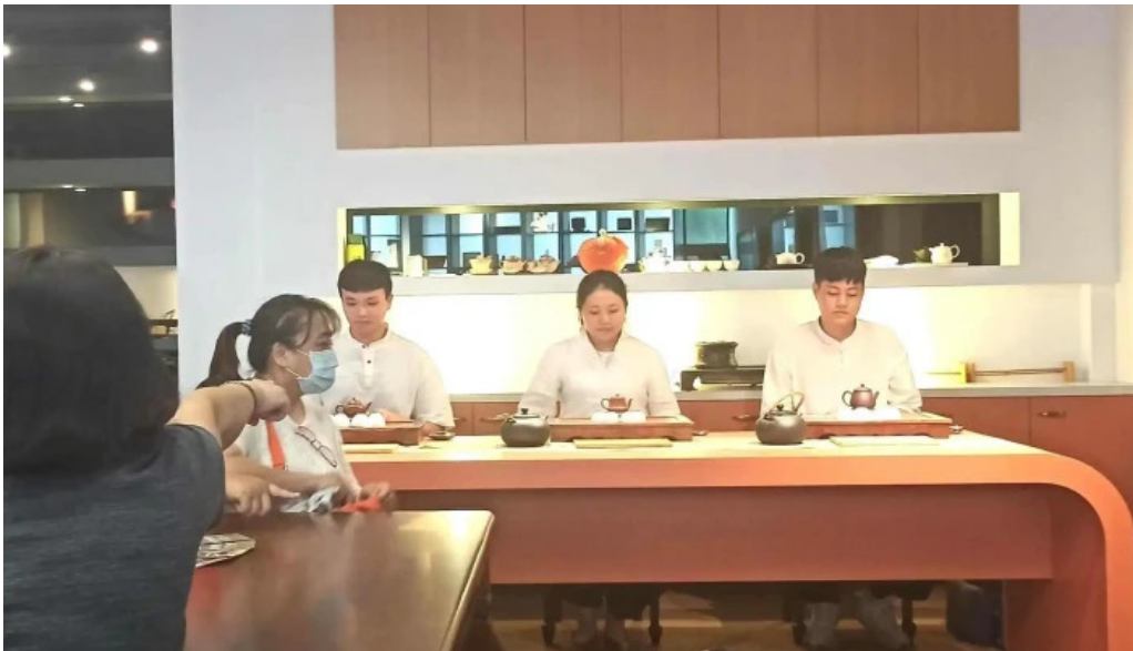
Da Tong Ji Zhu Xue Yuan ??