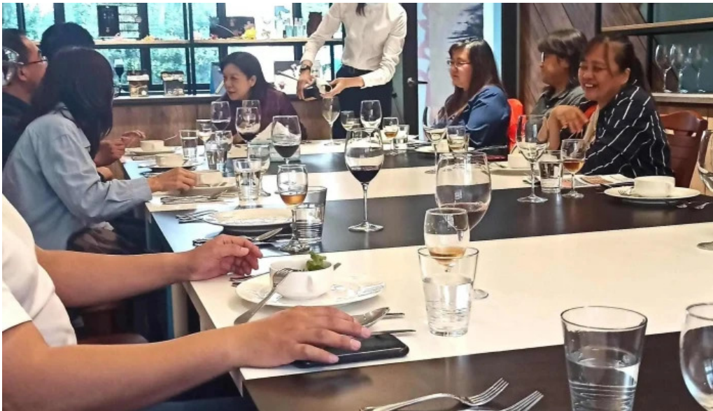
Da Tong Ji Zhu Xue Yuan chiayi city east district