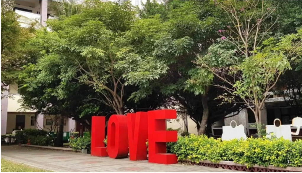
Da Tong Ji Zhu Xue Yuan ??