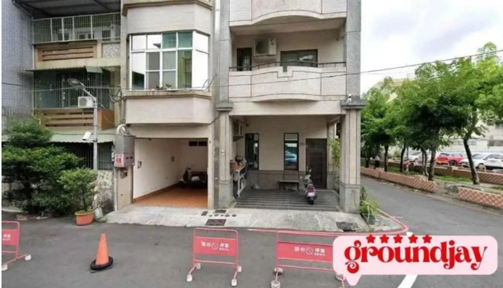
???????????? mitsuli technology co ltd kaohsiung city sanmin district