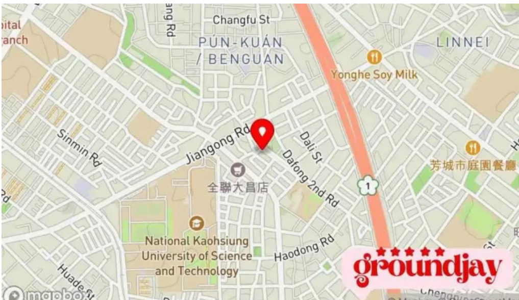
Qiang Dun Ke Ji Gu Fen You Xian Gong Si mitsuli technology co ltd ??