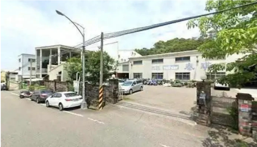
Tai Qi Nan Tou Zong Gong Si Quan Bu