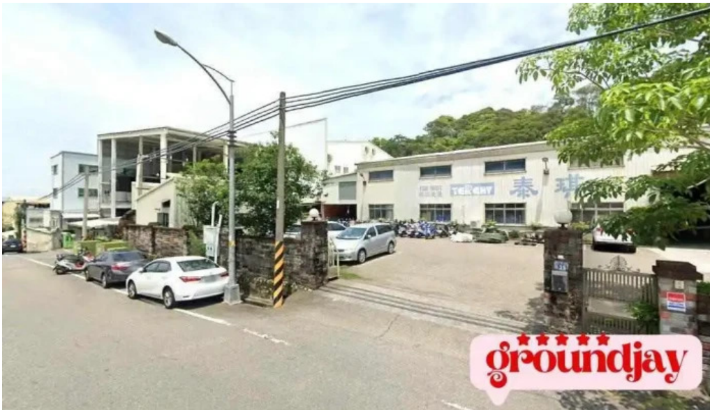
??????? nantou county nantou city