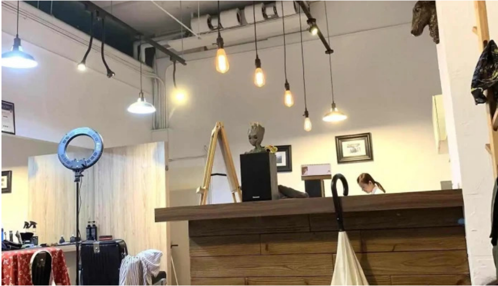
Ying Lun Shen Shi Fa Lang cutting edge barbershop Nei Bu