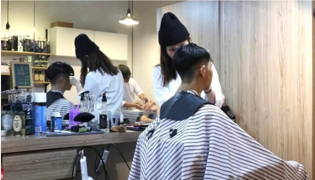
Ying Lun Shen Shi Fa Lang cutting edge barbershop Fa Xing