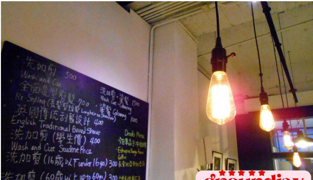
Ying Lun Shen Shi Fa Lang cutting edge barbershop Cai Dan