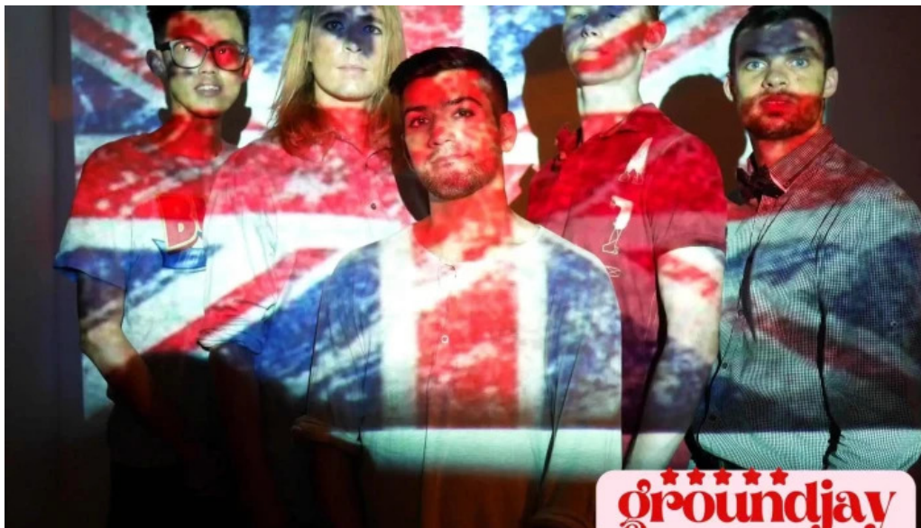
Ying Lun Shen Shi Fa Lang cutting edge barbershop Quan Bu