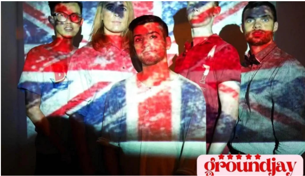
?????? cutting edge barbershop hualien county hualien city