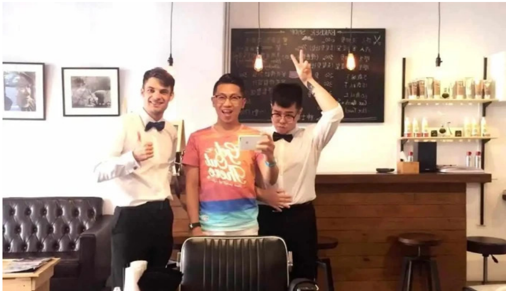
Ying Lun Shen Shi Fa Lang cutting edge barbershop Shang Jia Shang Chuan