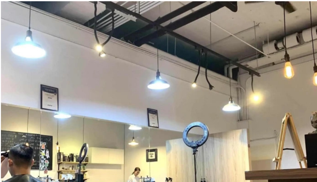
Ying Lun Shen Shi Fa Lang cutting edge barbershop ????