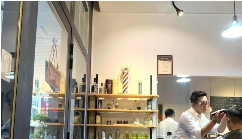
Ying Lun Shen Shi Fa Lang cutting edge barbershop ??