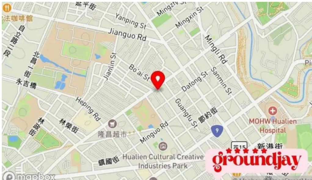
Ying Lun Shen Shi Fa Lang cutting edge barbershop ??