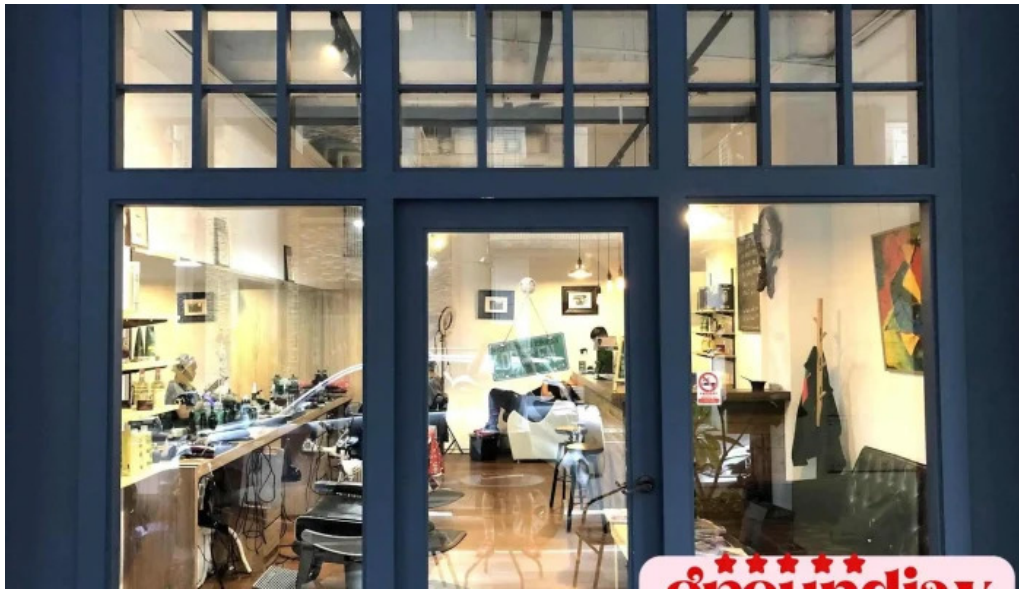
Ying Lun Shen Shi Fa Lang cutting edge barbershop Wai Guan