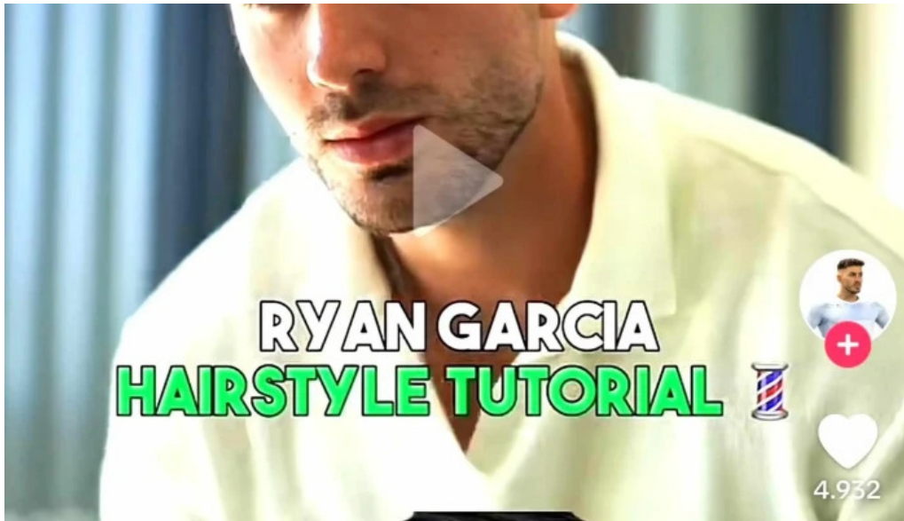
Ying Lun Shen Shi Fa Lang cutting edge barbershop hualien county hualien city