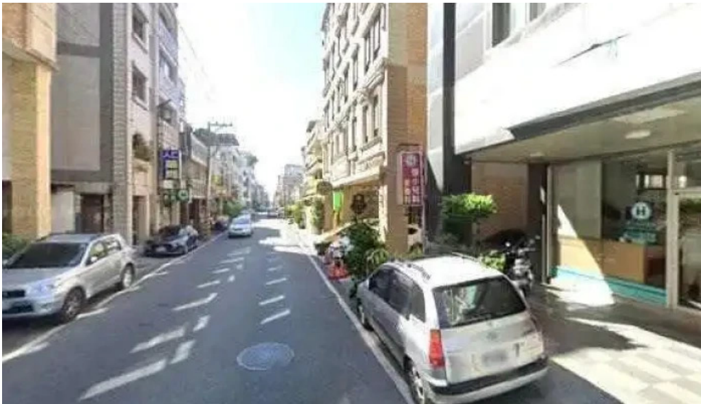
Ying Lun Shen Shi Fa Lang cutting edge barbershop Jie Jing He 360 Du Quan Jing Zhao