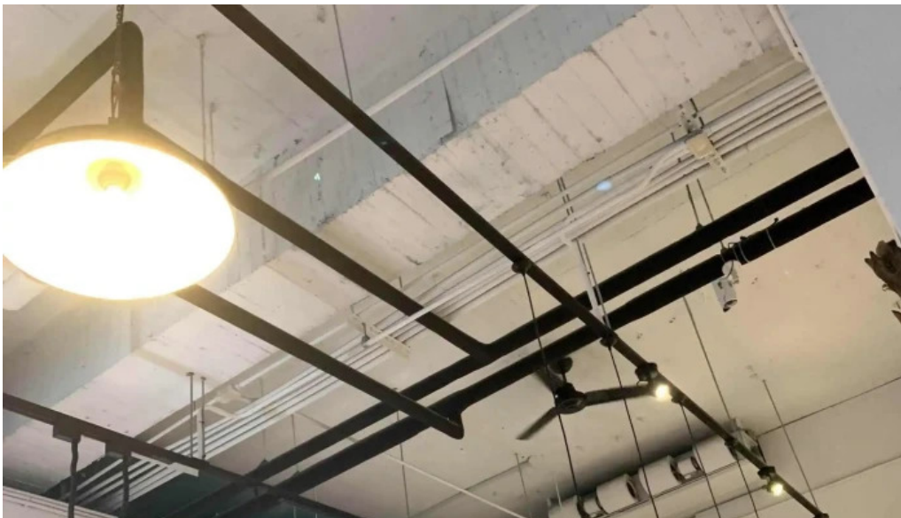
Ying Lun Shen Shi Fa Lang cutting edge barbershop ??