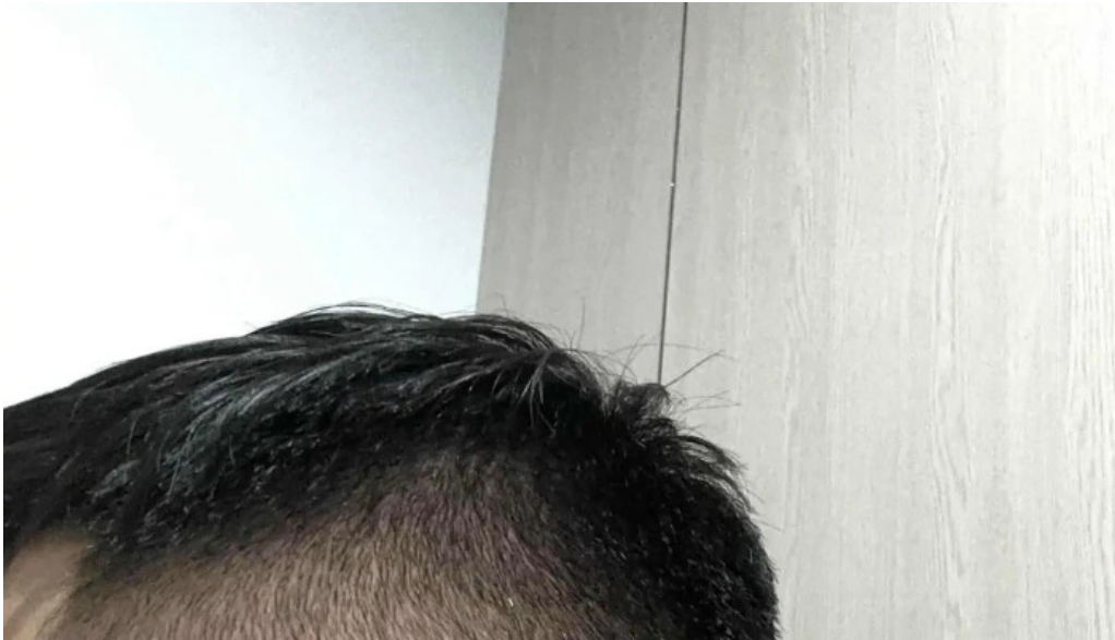
Ying Lun Shen Shi Fa Lang cutting edge barbershop ???