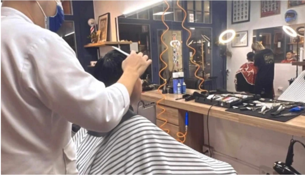
Ying Lun Shen Shi Fa Lang cutting edge barbershop ??