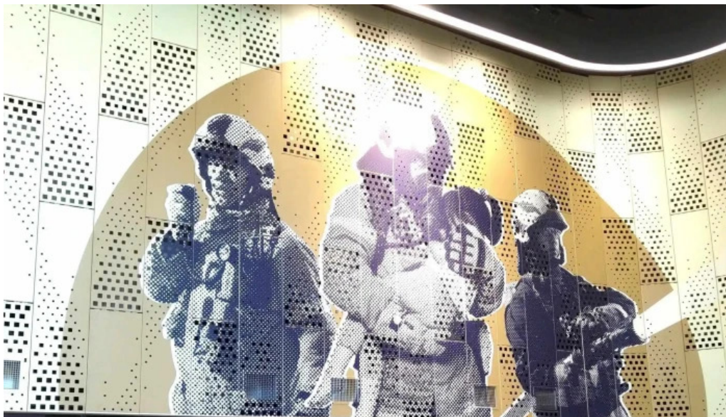
Taoyuan city fire department training center and disaster prevention education center ??