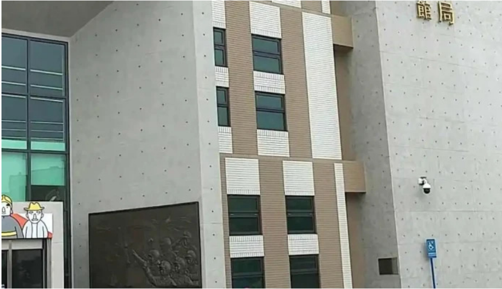
Taoyuan city fire department training center and disaster prevention education center Shi Pin