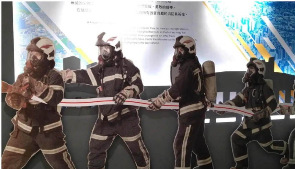
Taoyuan city fire department training center and disaster prevention education center ??