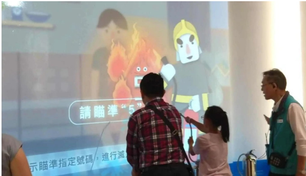
Taoyuan city fire department training center and disaster prevention education center ??