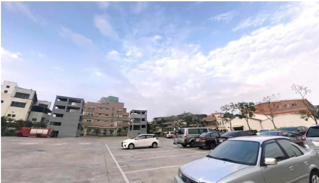
uan city fire department training center and disaster prevention education center Jie Jing He 360 Du Quan Jing 2