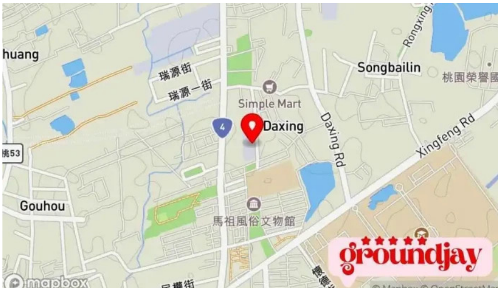
Taoyuan city fire department training center and disaster prevention education center ??