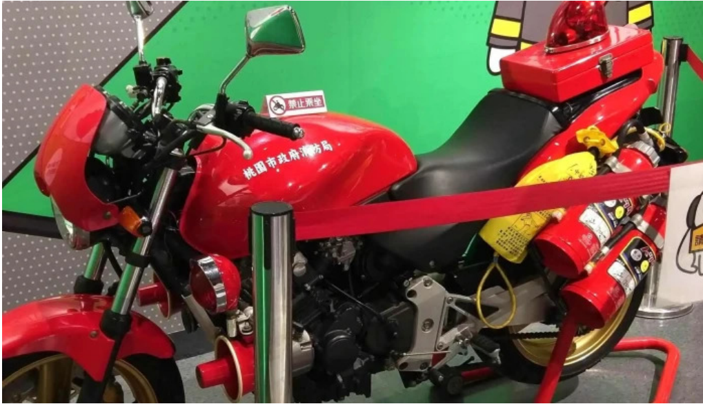
Taoyuan city fire department training center and disaster prevention education center taoyuan city bade district