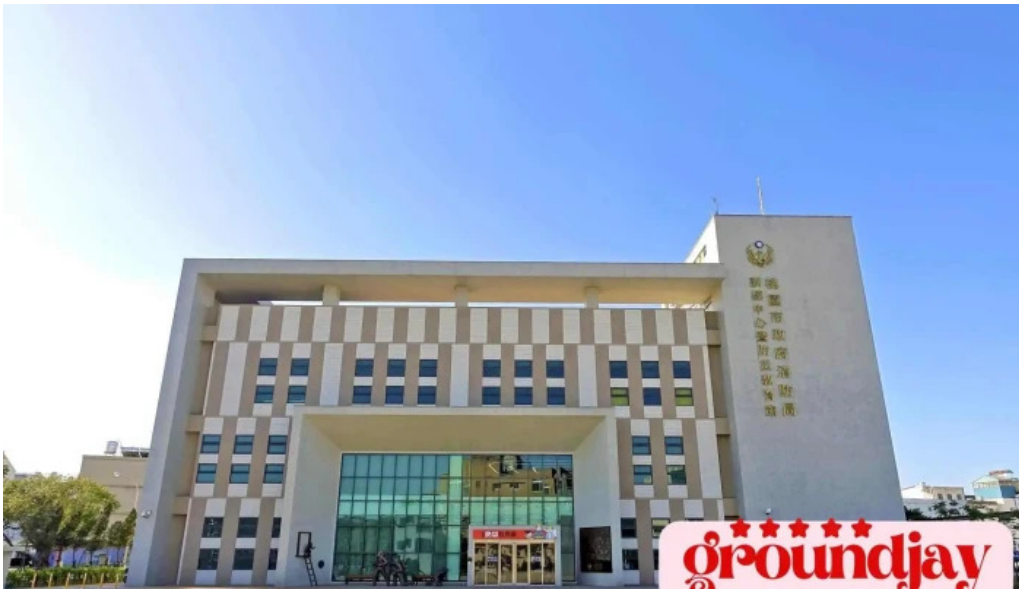
Taoyuan city fire department training center and disaster prevention education center Shang Jia Shang Chuan