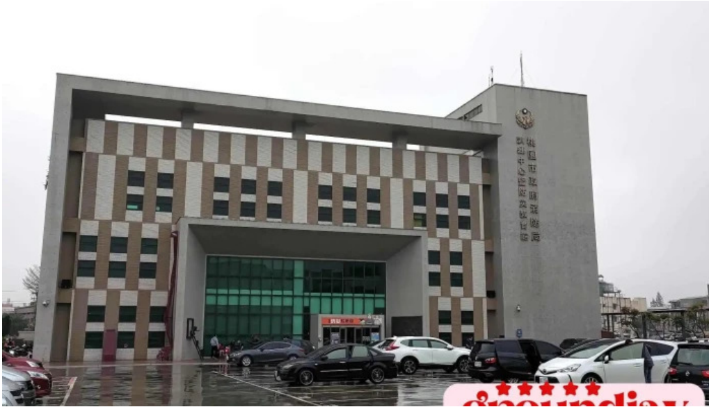
Taoyuan city fire department training center and disaster prevention education center Quan Bu