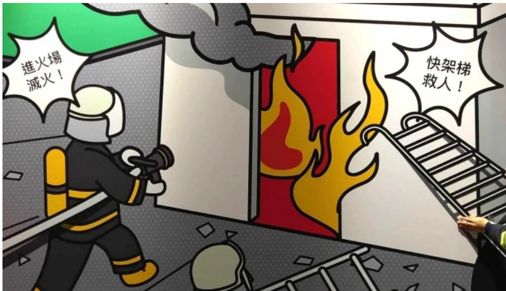
Taoyuan city fire department training center and disaster prevention education center ??