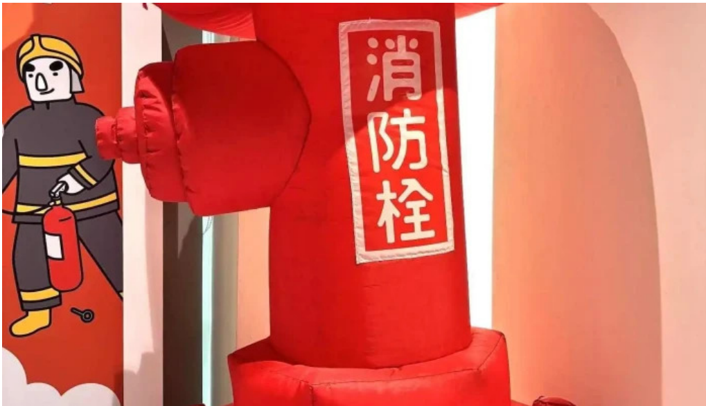
Taoyuan city fire department training center and disaster prevention education center Zui Xin