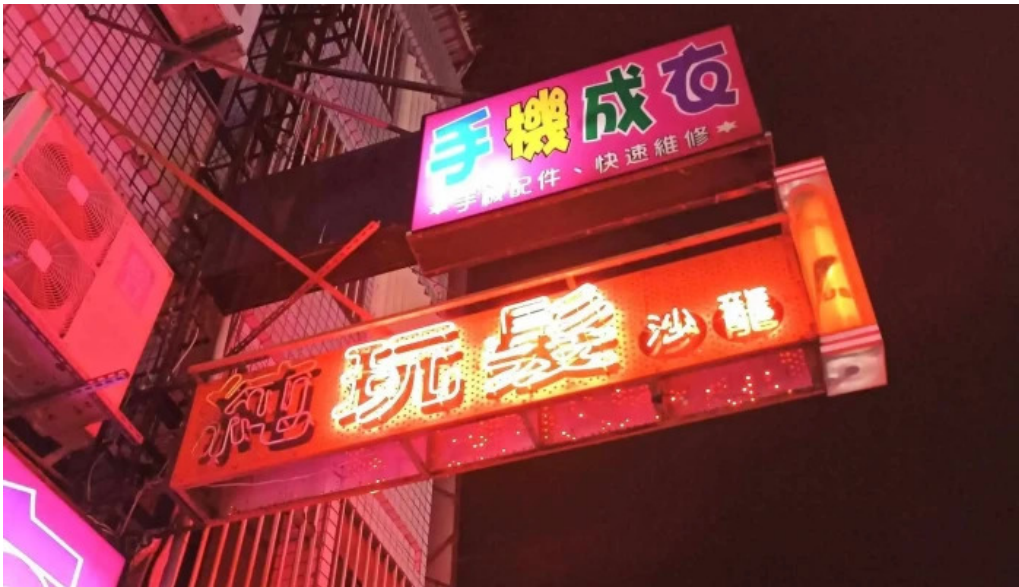
Chun Wan Fa Sha Long ???