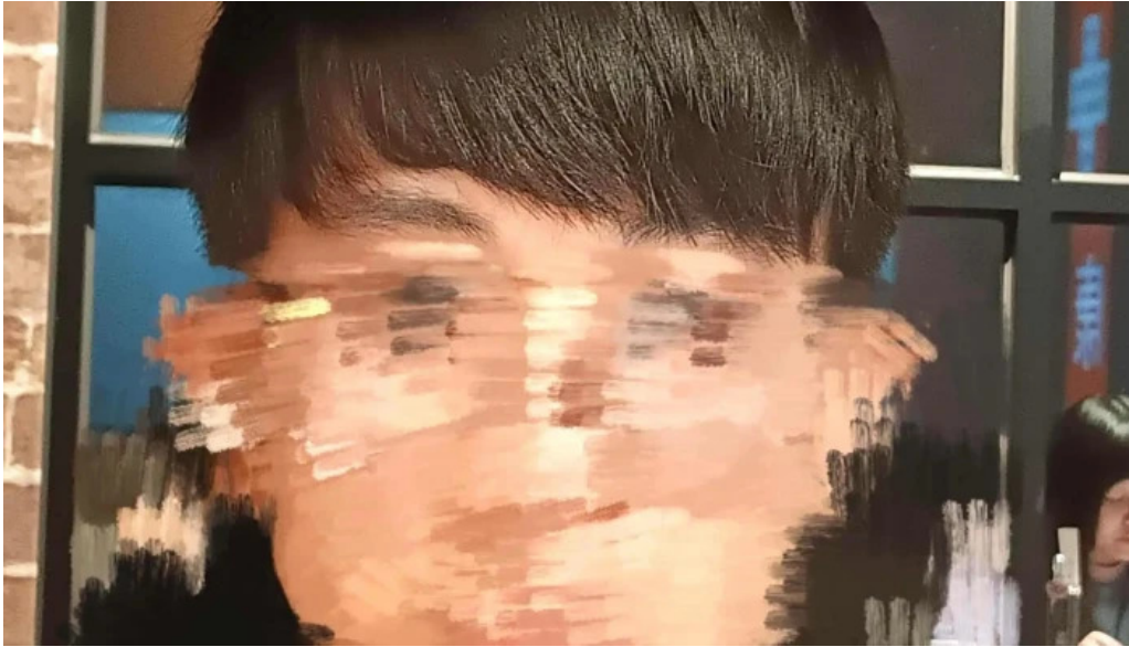
Chun Wan Fa Sha Long ????