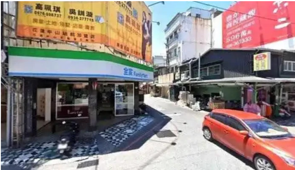
Chun Wan Fa Sha Long Jie Jing He 360 Du Quan Jing Zhao