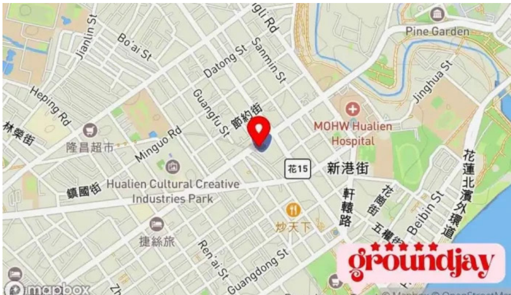
Chun Wan Fa Sha Long ??