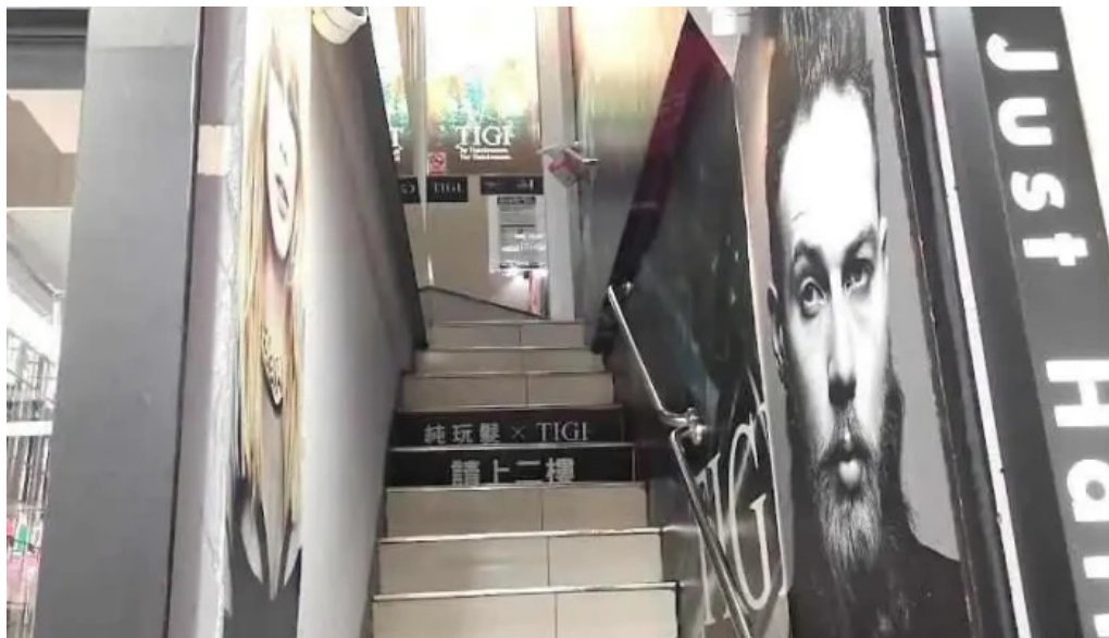
????? hualien county hualien city