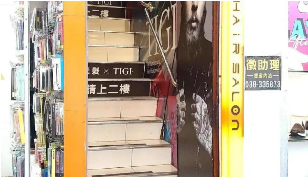
Chun Wan Fa Sha Long Wai Guan