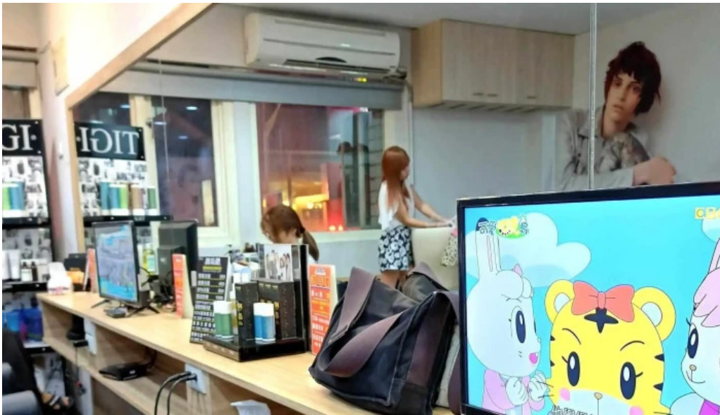
Chun Wan Fa Sha Long ??