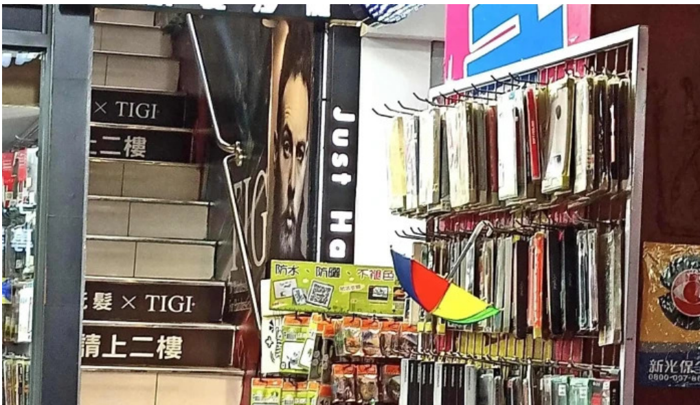
Chun Wan Fa Sha Long ??