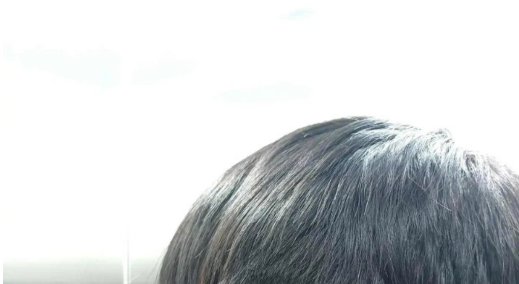
Chun Wan Fa Sha Long ??