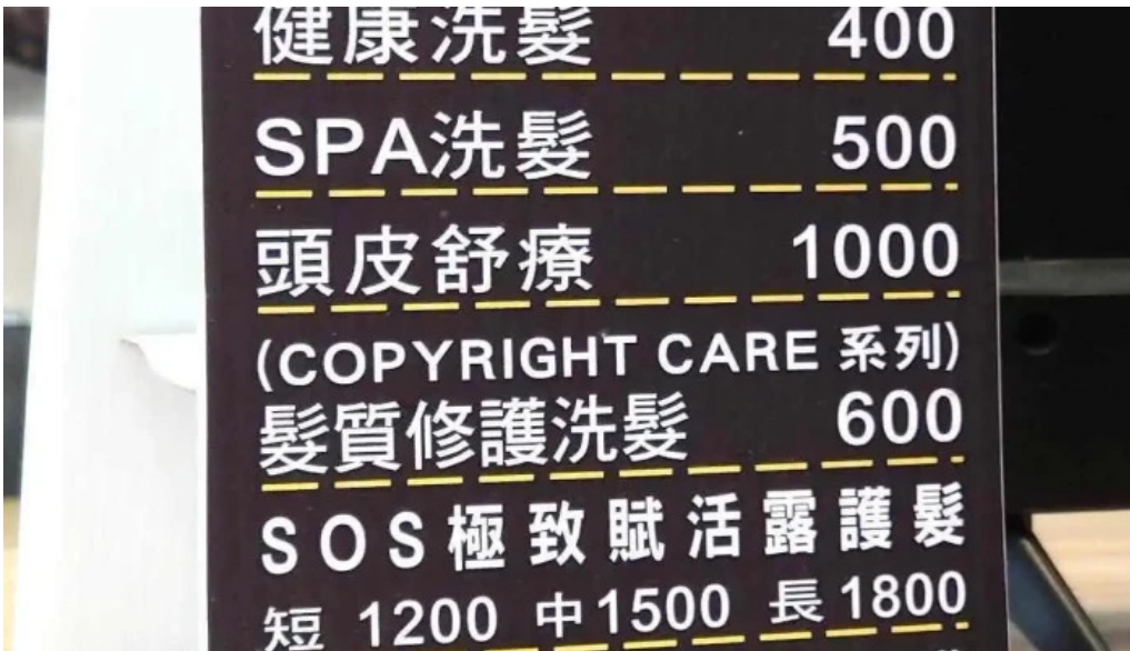
Chun Wan Fa Sha Long Cai Dan