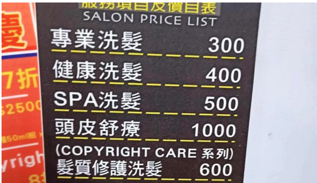
Chun Wan Fa Sha Long ??