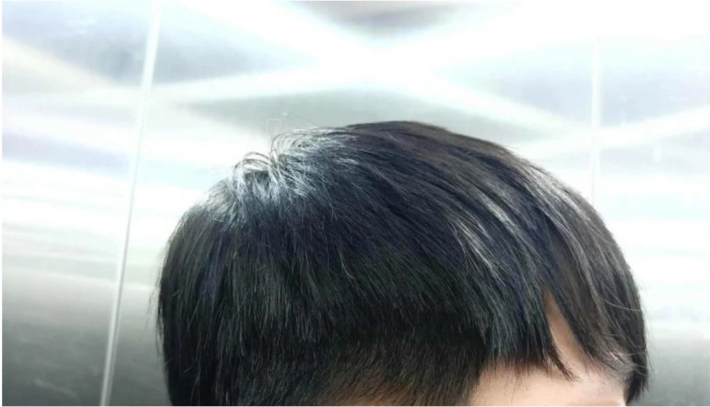
Chun Wan Fa Sha Long hualien county hualien city